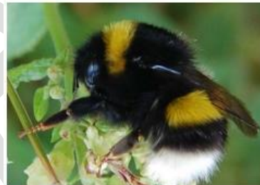
White Tailed Bumblebee